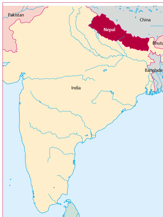
Figure 1: Makwanpur District, Nepal, and distribution of study village development committees

Nepal is administratively divided—in descending order of size—into development regions, zones, districts, village development committees, and wards. We chose the village development committee as the cluster unit of randomisation for the following reasons: it is a standard