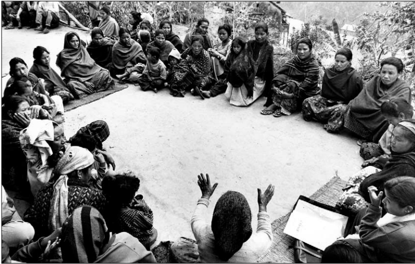
Figure 2: Typical women's group meeting

nature of the intervention the trial allocation was not masked, but analysis of primary and secondary outcomes was not done until just before the data monitoring committee meeting at 30 months. We generated the cluster allocation sequence in Kathmandu before enrolment of participants.