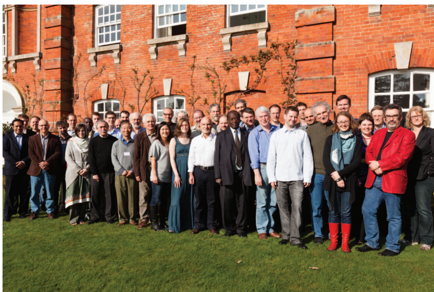
The participants of the March 2011 SRMGI conference, held at the Kavli Royal Society International Centre, Buckinghamshire, UK.