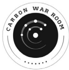
The Carbon War Room

SRMGI was funded by the three convening organisations, and by contributions from: