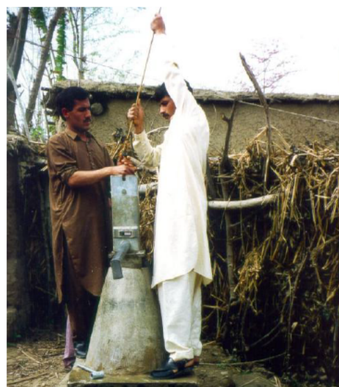
Operation and maintenance by users, Pakistan (E. Baumann)

The focus of Afridev development shifted to Kenya in early 1983, when the UNDP/World Bank Handpump Project set up a team to engage in the improvement of the design. The Handpump Project staged international handpump design meetings in Kenya in late 1984 and early 1986, and throughout this period, design and testing of pump heads, cylinders, rods and rising mains continued. Major efforts to resolve the "bearing problem" continued up to early 1985, when the plastic bearing design was finalised. Designers eventually settled for a simpler and more dependable plastic bushing design for the rod hanger and fulcrum, providing an inexpensive and durable alternative to ball bearings.