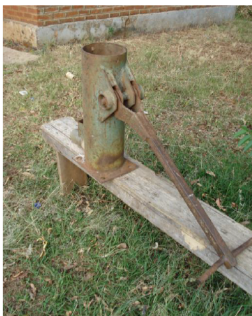
Maldev Pumphead Malawi

During the 1980s, the concept of community management of maintenance was introduced. The involvement of the users in repairs required pumps that allow interventions with a minimum of tools.