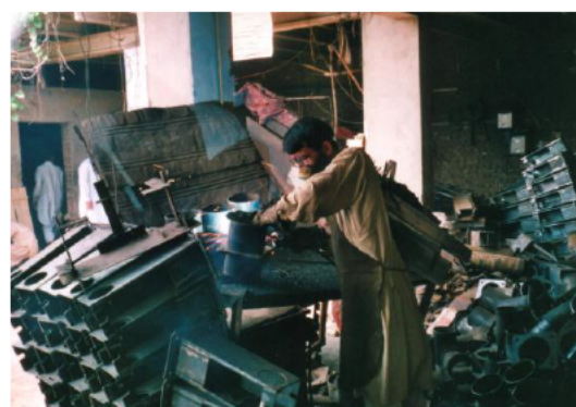
Afridev (Indus) Production, Afghanistan

Thanks to the successful design and the strong international partnership approach, the Afridev pump has become the second most popular community handpump in the world, after the India Mark II.