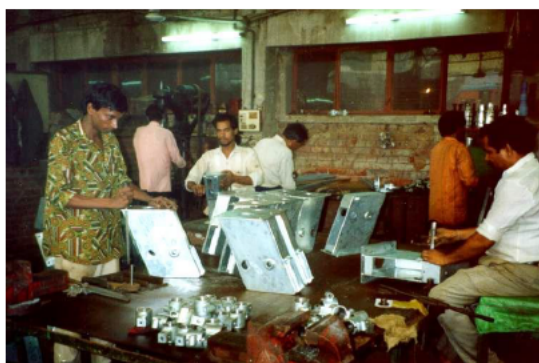
India Mark II Production

The India Mark II design was established by end of 1977 when UNICEF ordered 1000 pumps from Richardson & Cruddas for large-scale field-testing. The design found acceptance by the Government of India and a number of state governments. Demand started to rise. Already by 1978, Richardson & Cruddas manufactured about 600 India Mark II per month.