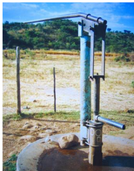
Anderson-type Bush Pump (P. Morgan)

The initial models remained almost unchanged for about 40 years until Cecil Anderson, an Engineer of the Ministry of Water, made the first major changes in the mid-60s. He replaced some of the bolted parts with components that were welded together. The remarkable idea to use U bolts to attach the pump head directly to the well casing dates back to that time. The improved pump was given the name of Bush Pump. It became the National Standard and was spread all over the country. After Independence in 1980, the government of Zimbabwe insisted on retaining its own national handpump, but many variations of the pump were built by NGOs, and also by some government departments. These were used alongside the standard Anderson model.