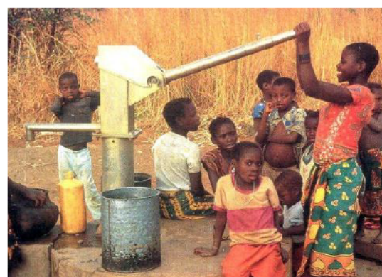
Afridev (K. Erpf)

The result of all these research and development activities was the final design concept of the Afridev handpump. It is a conventional lever action piston pump, with an "open top" cylinder design, allowing the pump rods, piston and foot valve to be removed for maintenance without lifting out the riser main pipes. It is designed to lift water from a depth no greater than 45 metres.