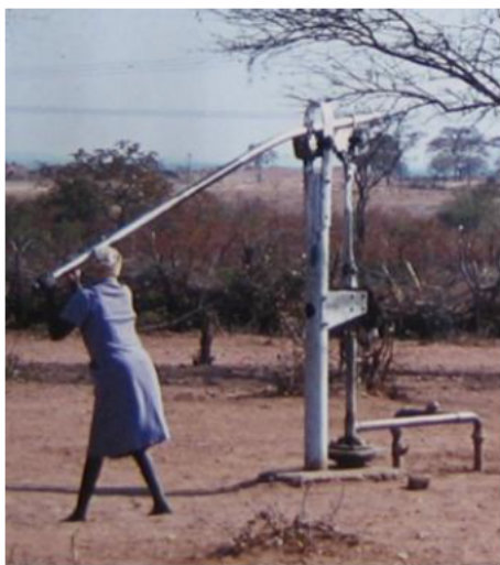
Murgatroyd-type Bush Pump (P. Morgan)

Compared to "modern" handpump designs, the Murgatroyd pump was over-engineered, and it looks ungainly at first sight. In fact, its sturdiness is a major reason why some of the early pumps continue to operate to the present day.