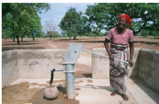
India Mark II in Africa (K. Erpf)

At the time when the pump was conceived, much less emphasis was given to the ease of repairs