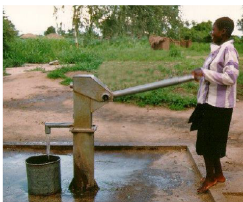
Afridev in Malawi

From the start, the aim was to produce a deep-well handpump that was very easy to maintain at village level and could be manufactured in countries like Malawi, where industrial resources are limited.