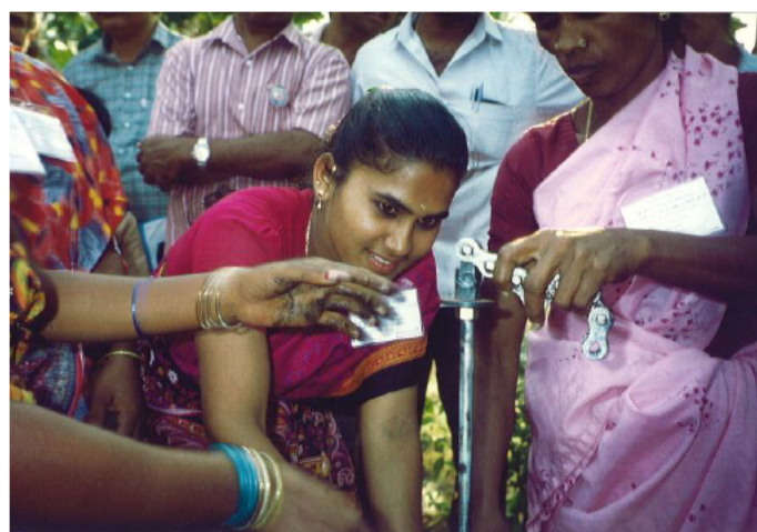
Operation & Maintenance by the Users (E. Baumann)

The capital cost of an India Mark III is about a third higher than that of the India Mark II, and due to the larger and heavier rising main, the maximum installation depth was limited to 30m. Higher capital expenditure could only be justified if it was offset by lower maintenance costs.