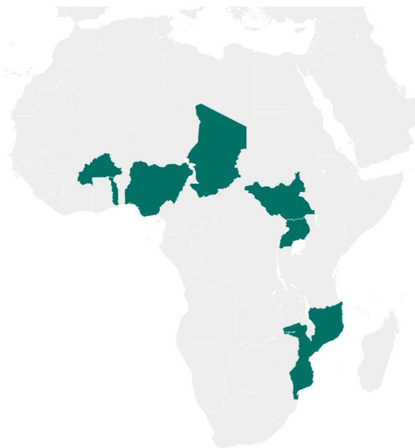
Figure 2. Countries where Malaria Consortium supported SMC in 2023

Countries and sub-national regions/states covered by Malaria Consortium’s philanthropically funded or co-funded SMC programme in 2023, dates of SMC rounds, and estimated target populations are shown in Table 1 .