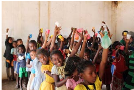
Mapping - sample collection