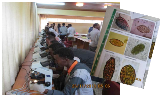
Figure 1 Slide reading training and different eggs to be identified

The SCI, in collaboration with Imperial College London colleagues from the Partnership for Child Development (PCD) supported the EPHI-led mapping of SCH and STH prevalence, collecting data from 125,000 school-age children across 2,700 primary schools. The partners in the project took advantage of this extensive logistics platform to also collect invaluable information on the school-level water, sanitation and hygiene (WASH) infrastructure, and school-feeding requirements from all sites.