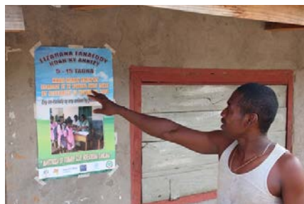
Community drug distributor with sensitisation poster

Madagascar, one of the largest islands in the world, is a low-income country that has suffered from several years of reduced international aid following a political crisis in 2009. Only recently has the country regained the confidence of donors, and has gradually been able to reinforce public health measures. Madagascar is endemic for five neglected tropical diseases (NTDs): schistosomiasis (SCH), soil-transmitted helminths: ascariasis, trichuriasis and hookworm (STHs), and lymphatic filariasis (LF). In most endemic districts, people have gone untreated for many years.