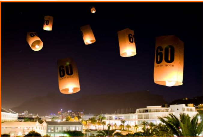
Seven lanterns were released from Cape Town, South Africa, symbolizing the seven continents participating in Earth Hour