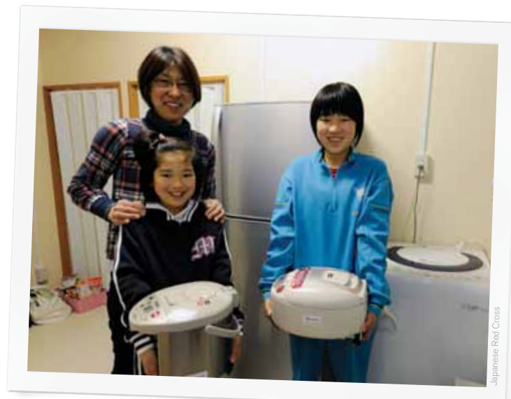
A family in their new temporary home with appliances provided in part by funding from the American Red Cross.

Due to the generous support of donors, the American Red Cross raised $312 million for Japan relief and recovery and, one year later, virtually all the funds have been spent. More than 90 percent of the money has gone to the Japanese Red Cross to improve living conditions for families who lost their homes and to rebuild needed hospitals and a nursing school. The remainder of the money has been used to cover costs the American Red Cross incurred assisting U.S. military family evacuations from Japan, U.S.-based preparedness efforts associated with the tsunami, as well as general operating costs of the American Red Cross.