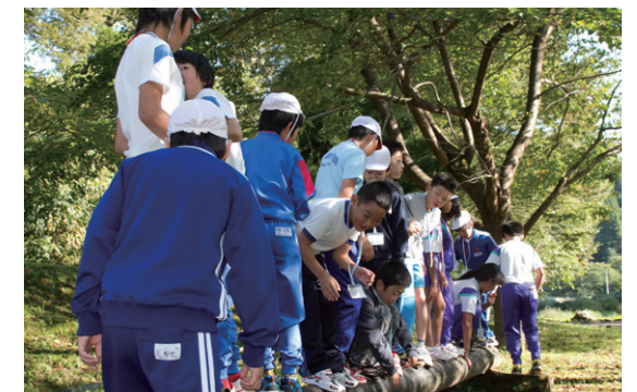
Children enjoying playing outside, without fear of radiation

Community gatherings have allowed evacuees from Fukushima to be re-united, as well as meet new neighbours in their host city, Kashiwazaki. In the community events, traditional meals are served, and dances and musical performances staged.