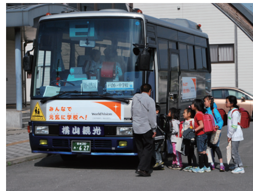
Students getting on the bus to go back to their home from the school.

When the tsunami washed away Togura primary and junior secondary schools in Minami Sanriku, students moved temporarily to a school in the neighbouring city, about 1 hour drive away. World Vision provided bus transportation enabling children to continue with their schooling. World Vision covered the cost of hiring the bus and driver and fuel costs until September 2011, when the local government was able to take over the running of the bus.