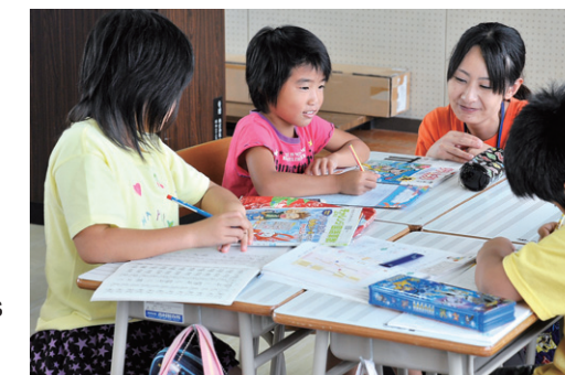
Children studying at the Child Friendly Space

For parents looking for work after the disaster or continuing with existing jobs, knowing their children were in a safe place after school helped to ease additional pressures associated with the loss of homes, families, friends and livelihoods. For children, being at a Child Friendly Space meant playing again, having fun with friends, and having other students and teachers understand what they have been through. Formal and informal education, as well as routine helped children regain a sense of normalcy – essential for children's well being after a disaster.