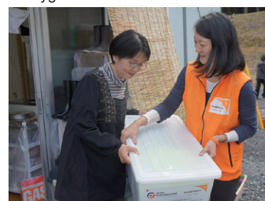
World Vision provided essential household items to 13,343 people residing in temporary houses.