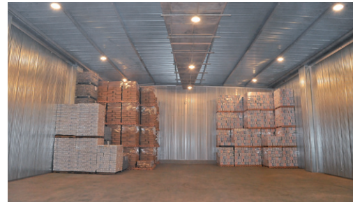
Post-repair, the Kesennuma freezer warehouse will eventually be able to store almost 170,000 tonnes of fish and seafood.

Bringing business back to Kesennuma is essential to help fishermen and their families keep the fishing industry going. As part of a re-branding campaign, World Vision helped with messaging and production of 40,000 stickers. Dealers and distributors used the stickers on stock issued to other parts of the country.