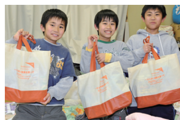
Boys at an evacuation centre received hygiene kits from World Vision.