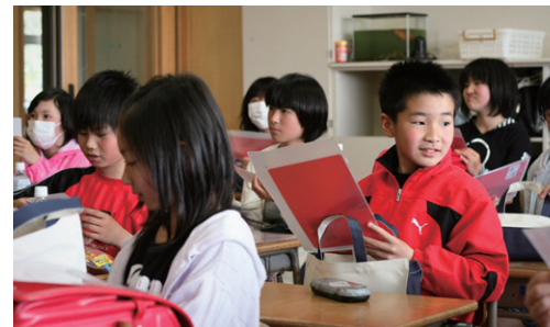
WV provided school kits to the children in time for the new semester that was delayed for 1 month due to the quake

World Vision assisted 50 local schools with a range of equipment to help educational facilities recommence classes after the earthquake and tsunami. Educational materials, uniforms, and classroom equipment for regular schools, as well as specialist equipment for an agricultural school and a fishery school were issued.