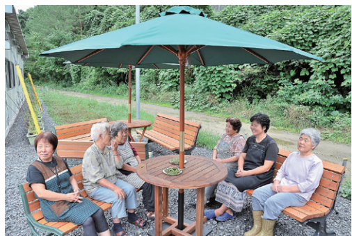
Table and chair settings provided the ideal place for women to gather, encouraging a new sense of community amongst displaced tsunami survivors.

World Vision financed the printing of booklets with practical tips on living in a temporary housing setting. The booklets, in a seniors-friendly format (large type and many photographs) were created in collaboration with Niigata University and based on ideas by survivors of the Chuetsu Earthquake of 2004.