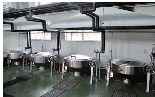
Cooking equipment installed at the restored school meal centre

World Vision is assisting with the temporary restoration of school meal centres in Minami Sanriku. Full restoration of meal centres is likely to take years, so an interim response is required. Additional cooking equipment, as well as a cleaning facility are being provided.