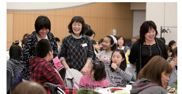
People and children re-united with their friends and neighbors.