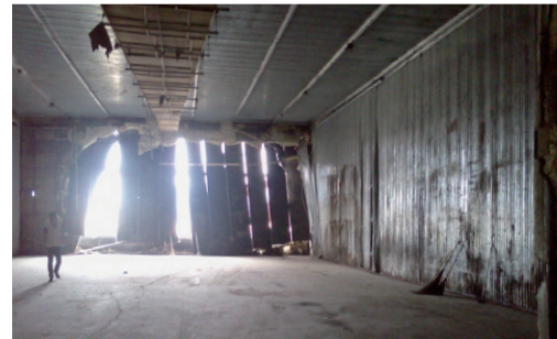
Freezer warehouse in Kesennuma after the 11 March tsunami tore through the city

Some 26,000 fishermen, and indirectly their families, will benefit from the reconstruction of a large scale freezer warehouse in Kesennuma, Miyagi prefecture. Almost all of the 90 freezer warehouses in Kesennuma were destroyed by the tsunami. Prior to the tsunami, the freezer warehouses could freeze 2,000 tonnes and refrigerate 165,000 tonnes of fish and seafood. As at December, 2011, the capacity to freeze and refrigerate was at only 200 tonnes and 15,000 tonnes respectively. By the end of March 2012, World Vision Japan aims to support an additional 60 tonnes and 3,000 tonnes.