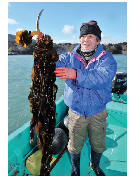
A fisherman cultivating wakame (seaweed) by using a small boat provided by World Vision