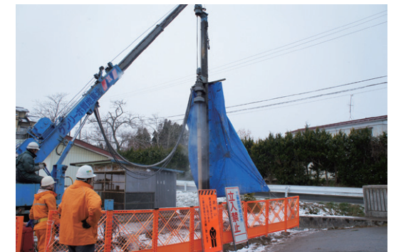
Wells under construction

Small boats were provided to 'wakame' fishermen in 12 ports in Shizugawa and Tokura districts, Minami Sanriku, Miyagi prefecture. As World Vision was able to provide the vessels prior to the seaweed planting season, fishermen were able to recommence their livelihoods, and cultivation could take place in the appropriate season; a boost to the fishermen's income-earning capacity.