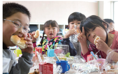
Children enjoying nutritious school meal

The Government of Japan provides school meals to public schools and daycare facilities for infants during the school semester. When the tsunami damaged or destroyed school meal centres, only milk and bread was provided for lunch. In collaboration with a local baking company, World Vision funded a school meal centre in Minami Sanriku, which provided cooked meals to 4 primary schools and 2 junior secondary schools every day. The provision of 4 kilns has enabled school meal centres to resume cooking meals at least one day per week.