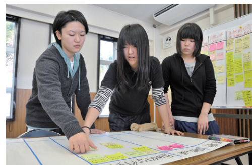
Junior leaders' workshop

In January and February 2012, World Vision Japan held events for junior leaders in Minami Sanriku, to gather feedback on how children can contribute to the rebuilding of their town. World Vision and the School Board of Minami Sanriku worked with children to collate their input and prepare a presentation to the Mayor of Minami Sanriku.