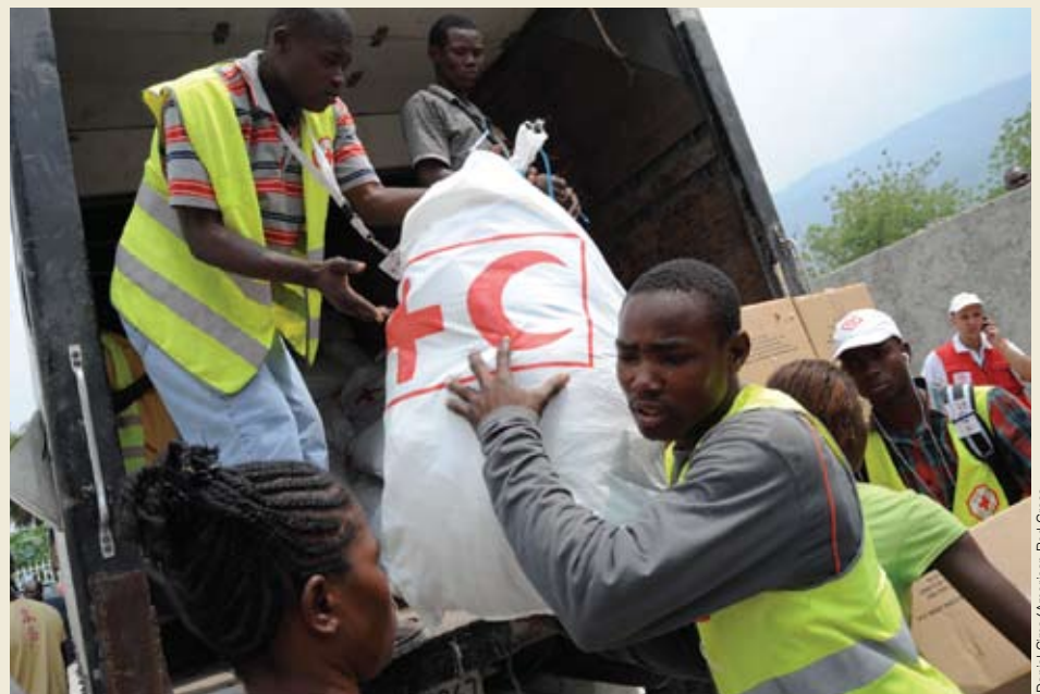
Red Cross volunteers unload and distribute rice bags full of relief items for families now living in settlements near Centreville, a neighborhood in Port-au-Prince.

The American Red Cross has provided 43 percent of the items distributed by the global Red Cross network in Haiti. Watch a behind-the-scenes video of the Red Cross relief distributions during the first few weeks of the disaster response.