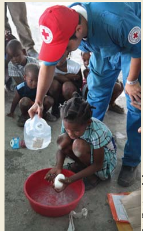
Red Cross volunteers share health and hygiene messages with young earthquake survivors in Carrefour.

Red Cross teams are also finding innovative ways to communicate health and hygiene information, including through street theater