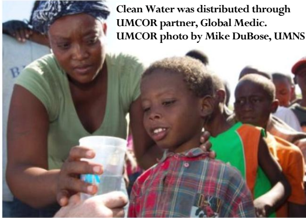
Clean Water was distributed through UMCOR partner, Global Medic.