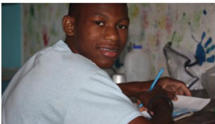
The Methodist Children’s Home is one of the ministries supported by UMVIM.