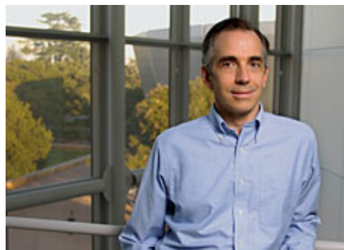
Drexler

As you know, I introduced the term "nanotechnology" in the mid-1980s to describe advanced capabilities based on molecular assemblers: proposed devices able to guide chemical reactions by positioning reactive molecules with atomic precision. Since "nanotechnology" is now used to label diverse current activities, I have attempted to minimize confusion by relabeling the longer term goal "molecular manufacturing." The consequences of molecular manufacturing are widely understood to be enormous, posing opportunities and dangers of first-rank importance to the long-term security of the U.S. and the world. Theoretical studies of its implementation and capabilities are therefore of more than academic interest and are akin to pre- Sputnik studies of spaceflight or to pre-Manhattan Project calculations regarding nuclear chain reactions.