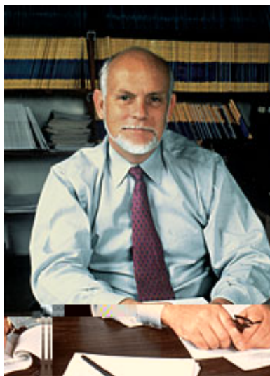
Smalley